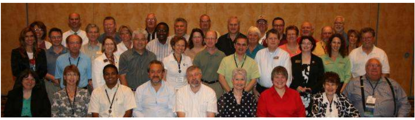
IAFP Affiliate Council meeting, July 2009.